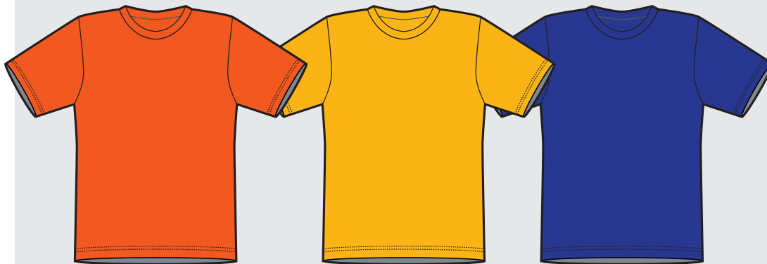
Available in a variety of colours